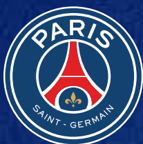
PARIS SAINT-GERMAIN F.C.